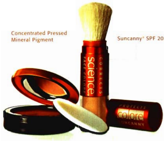
Concentrated Pressed Mineral Pigment