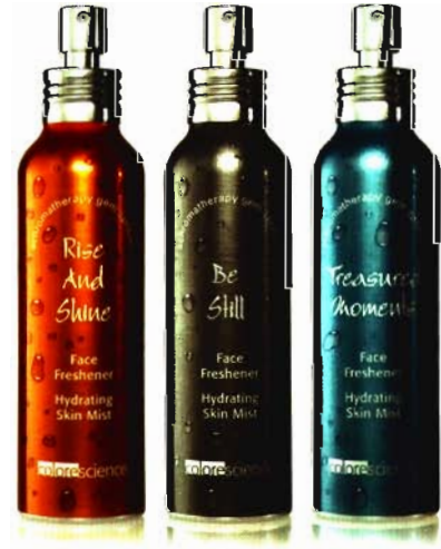
Aroma Water Serums